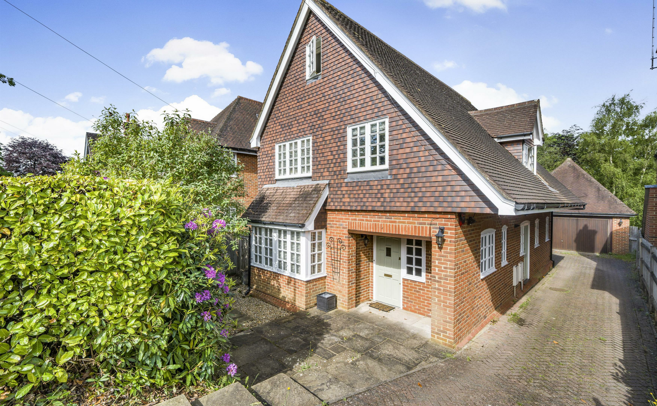
Padrays, Beech Road, Haslemere GU27 2BX Freehold